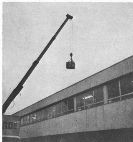
The new equipment about to be lowered through a skylight into the new filmset department.